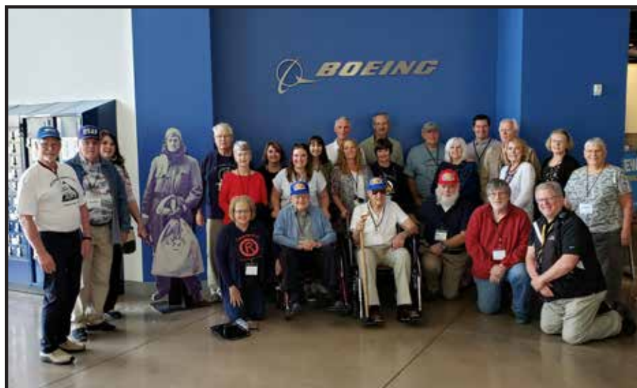
Group at Boeing Museum