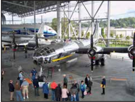
B-29 at the Museum of Flight