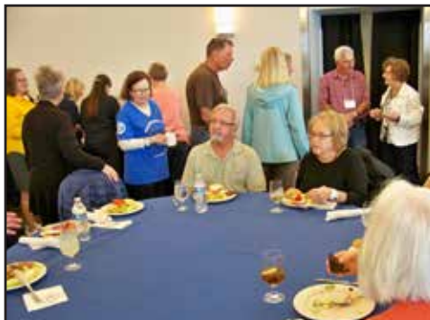
Museum of Flight lunch