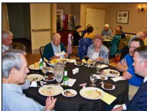
The Vincent Table