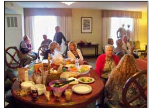
Hospitality Room Group