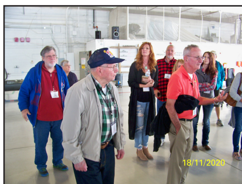
In the Warhawk