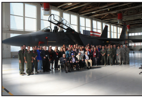
At Mountain Home AFB with an F-15