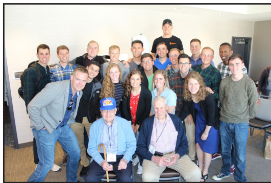
With the Air Force Academy Cadets