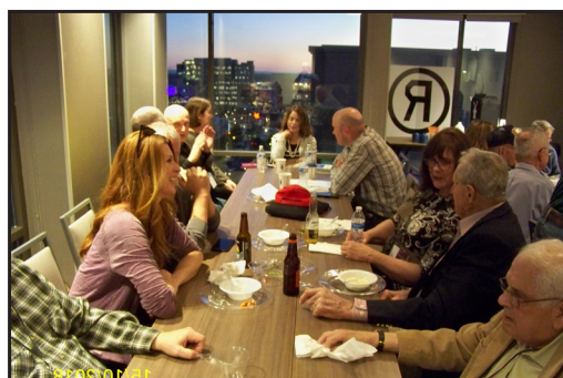
First Night Social