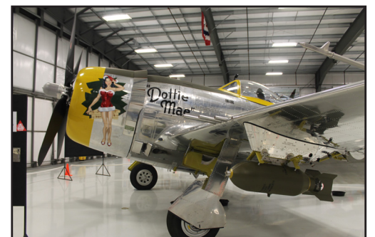
The Dottie May at the Warhawk Museum