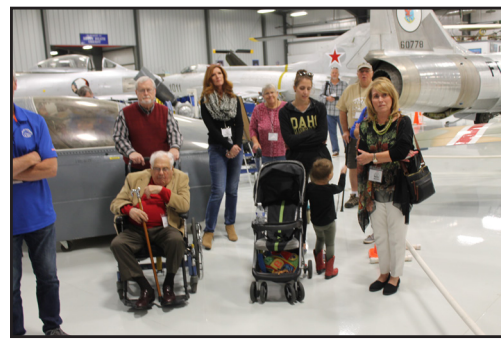
At the Warhawk